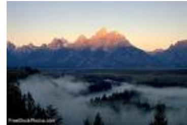
Grand Tetons, Wyoming